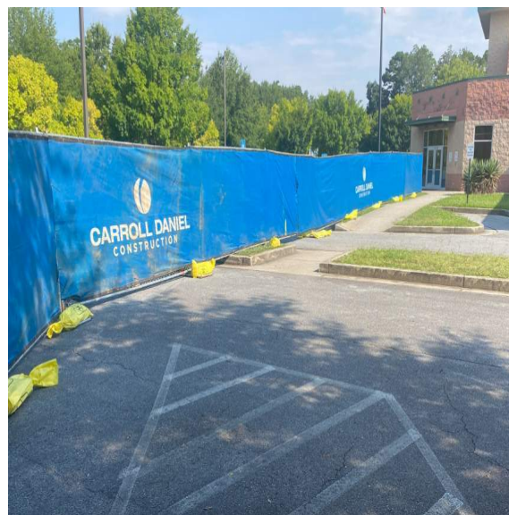
Temp fence and screening installed for Phase 1 of construction