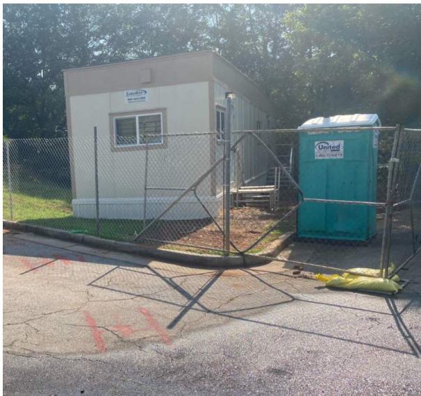
Construction Trailer set up and active