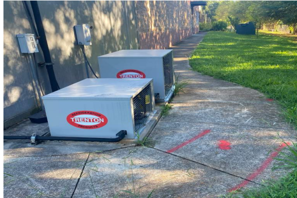
Locating and layout of site utilities

Next OAC meeting: Tuesday, September 3rd, 2024