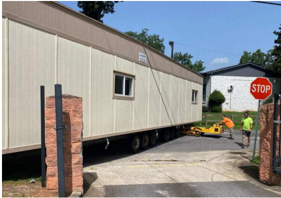
Construction Trailer being moved into rear of campus